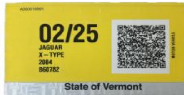
Current Inspection Sticker