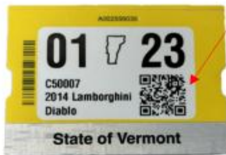
New Inspection Sticker